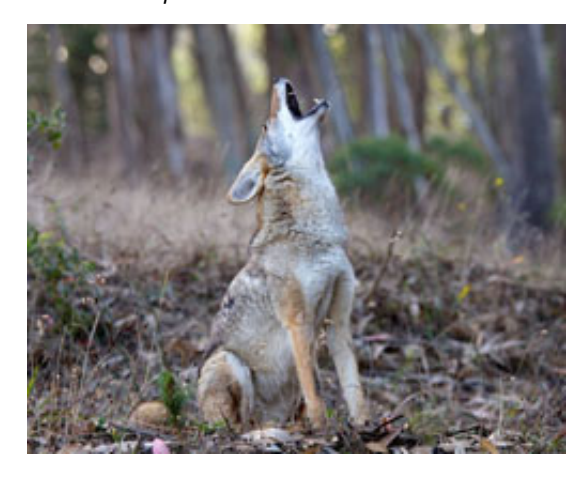
Barking in distress after being chased by dogs is not the same as joyful howling.