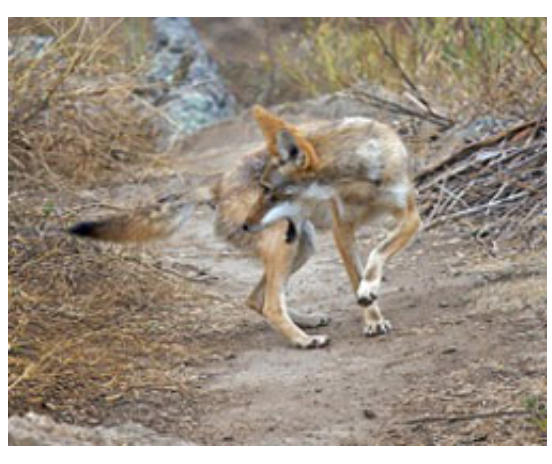
Self-entertainment is common: here chasing one's tail fills the bill