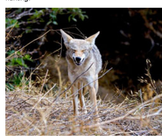
Coyotes have a lot of personality and numerous of facial expressions.