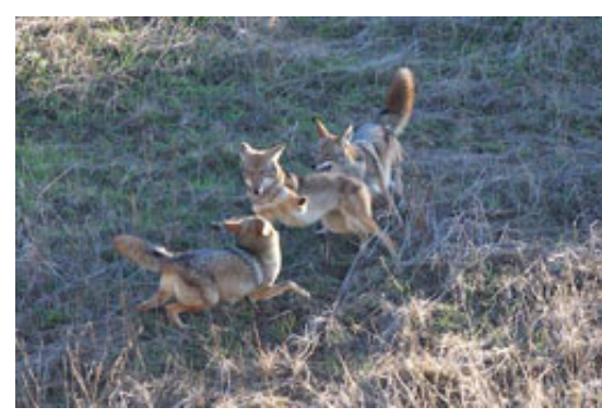
Coyotes love to play -- here they are playing chase