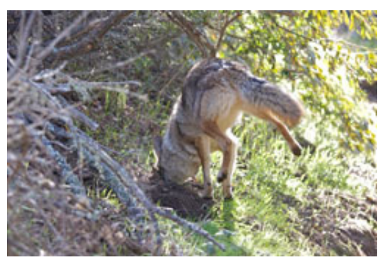
Nose diving with heels kicking high is effective in hunting!