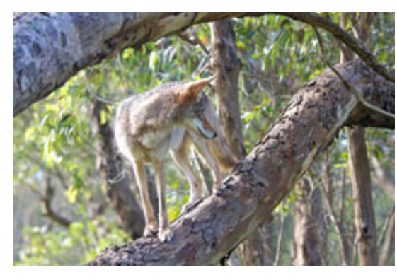
Covotes are resourceful in their hunting methods here one is up in a tree!