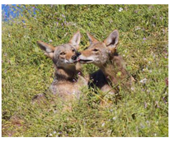
There is always a lot of affection blatantly displayed in coyote families.