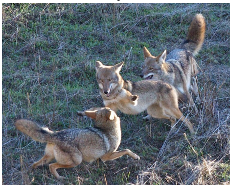
Game of Chase