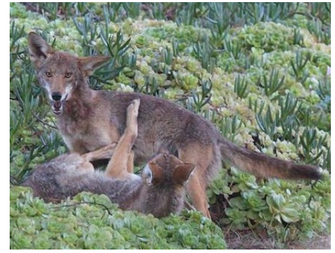
Siblings at Play